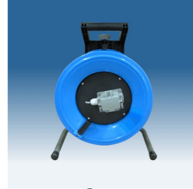
Optional: Cable reel