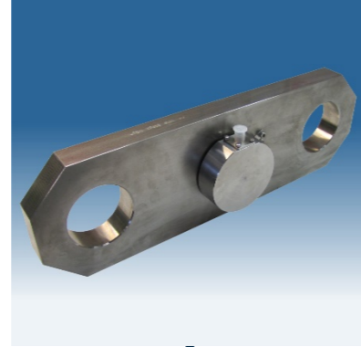
Force transducer KMD fSENS